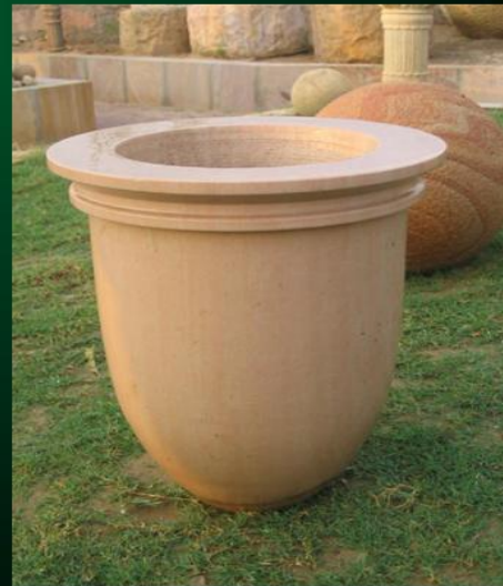
Flower pot-FP-06 dia-10" [250mm.] top height-14" [350mm.] Weight-40 Kg.