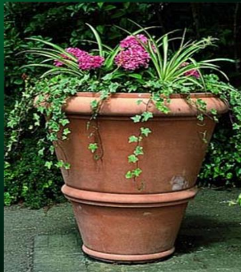
Flower pot-FP- 14 Overall top dia- 20" [500mm.] Overall top height-20" [500mm.] Weight- 125 Kg.