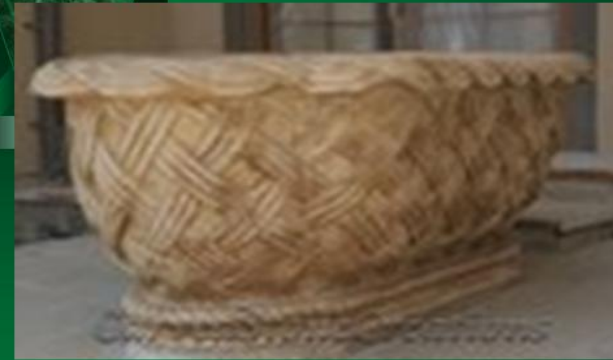
Flower Pot- FP-26 Length-42" [ 1066mm.] Width-15" [ 381mm.] Height 18" [ 450mm.] Weight 145 Kg.