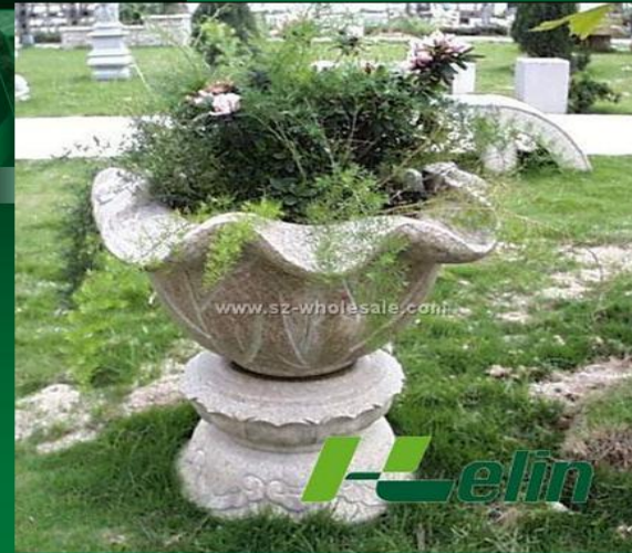
Flower pot- FP-15 Overall top dia-18" [450mm.] Overall top height-18" [450mm.] Weight- 125 Kg.