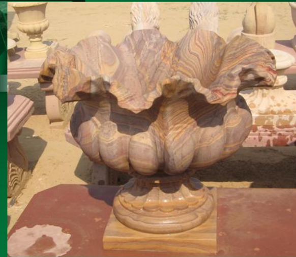
Flower pot- FP-11 Overall top dia-18" [450mm.] Overall top height-18" [450mm.] Weight- 70 Kg.