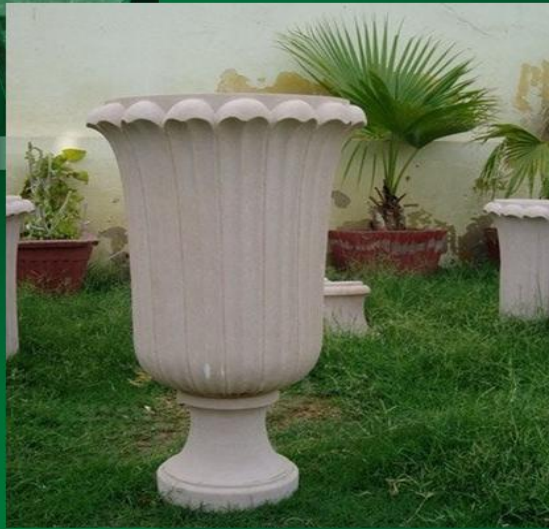
Flower pot- FP -09 Overall top dia-20" [500mm.] Overall top height-42"[1050mm.] Weight- 425 Kg.