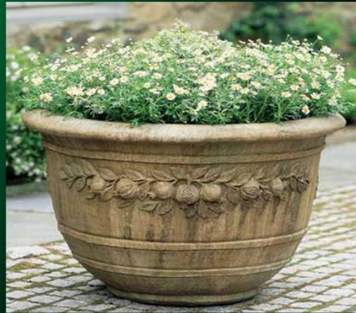
Flower pot- FP-10 Overall top dia-20" [500mm.] Overall top height-18" [450mm.] Weight- 70 Kg.