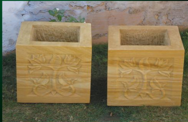
Flower Pot-FP -26